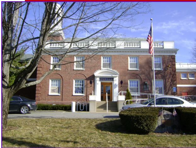
NEEDHAM POLICE STATION 99 SCHOOL STREET

Sunday, September 30, 2018 11:00 a.m. to 1:00 p.m.