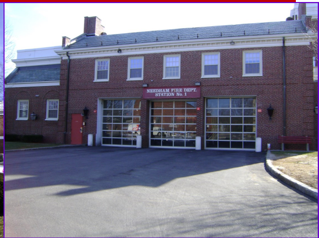
NEEDHAM FIRE STATION 88 CHESTNUT STREET

Residents will be asked to vote on a debt exclusion override question on the November 6, 2018 ballot for the new Public Safety Building and Fire Station #2.