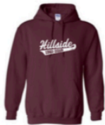
Gildan Heavy Blend Hooded Sweatshirt (offered in pink ink)

Online Store Deadline: Friday October 12th, 2018 (11:59pm EDT)