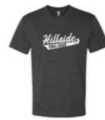
Next Level Premium Crew