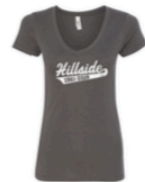
Next Level Women's V-Neck