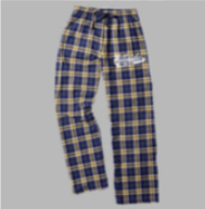
Boxercraft Flannel Pant