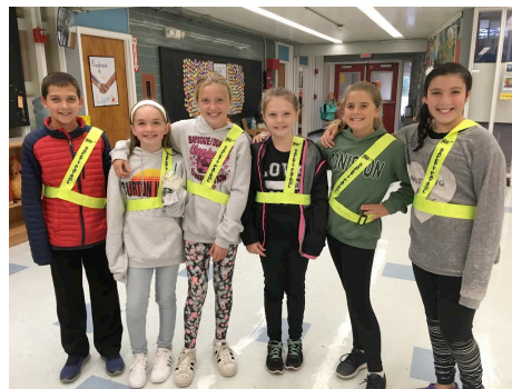
A few of our illustrious student sidewalk buddies!